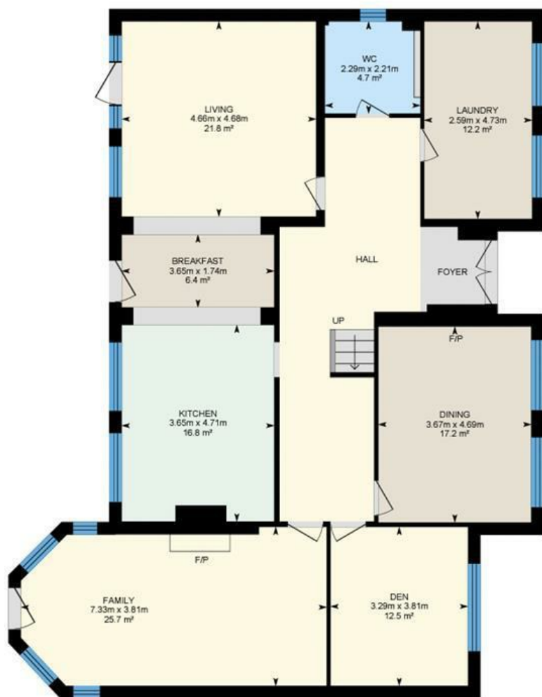
Ground Floor Exterior Area 172.68 m 2

Main Building: Total Exterior Area Above Grade 330.97 m 2