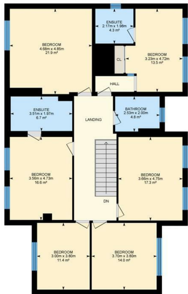
1st Floor Exterior Area 158.29 m 2